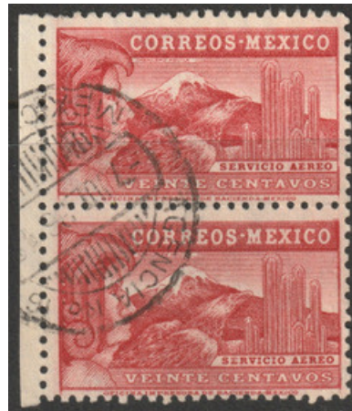
gb25 Airmail C76A Watermark 260 used F-VF Pair est. $60-100 starting at $69.50

Now we come to the last of the big "Three": Price. You have been sitting there at a dealer's table or looking at an auction lot. You have pored over the catalog and even looked up past sales. The number of prices starts to pour out all over the stamp. One catalog says it should sell for $5, but another one puts the value on something like an Overprint, as in the Mexican Districts. It may show up in that specialized catalog for $50, not $5. This is where experience matters, and knowledge is 'King.' There is one rule I have followed as a dealer: they should know what they are selling. I also apply this to myself. So, if that stamp is marked $10, the quality is there; buy it if you need it. Unbeknownst to the dealer who priced his item at twice the catalog price, he didn't know its real value. Now, if you don't want the stamp after all, point out to him that the stamp is from a better district.