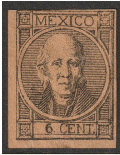
gb11 #58 6ctv Plate proof t-3 w/o Overprints F-VF est $50-100 starts at 39.50

As I became more interested in collecting the classic issues of the USA, my attention turned to the 'Three Things to Do'. Appearance was the first down to the basics: "What it looked like." Do I need it, or do I just want it? Then Quality came into play. Was it a nice stamp, free of faults, and did I really still want it? Lastly, if I had decided I wanted it, I would have had to consider the price. So, let's look closer at how these three factors will work for any collector, from the novice to the expert philatelist.