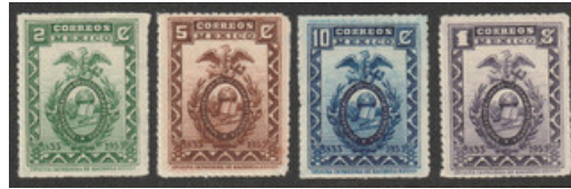
gb24 #684-7 2ctv-1Peso Mint hinged VF est $60-100 starting at $50.50

Now we come to the last of the big "Three": Price. You have been sitting there at a dealer's table or looking at an auction lot. You have pored over the catalog and even looked up past sales. The number of prices starts to pour out all over the stamp. One catalog says it should sell for $5, but another one puts the value on something like an Overprint, as in the Mexican Districts. It may show up in that specialized catalog for $50, not $5. This is where experience matters, and knowledge is 'King.' There is one rule I have followed as a dealer: they should know what they are selling. I also apply this to myself. So, if that stamp is marked $10, the quality is there; buy it if you need it. Unbeknownst to the dealer who priced his item at twice the catalog price, he didn't know its real value. Now, if you don't want the stamp after all, point out to him that the stamp is from a better district.